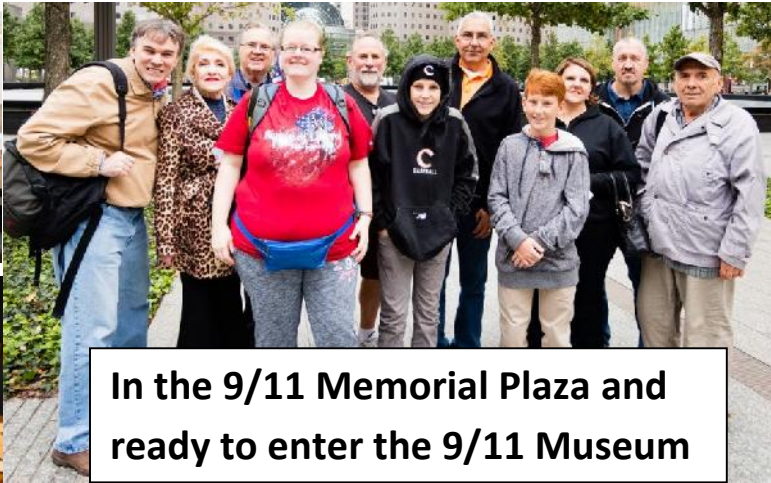
In the 9/11 Memorial Plaza and ready to enter the 9/11 Museum