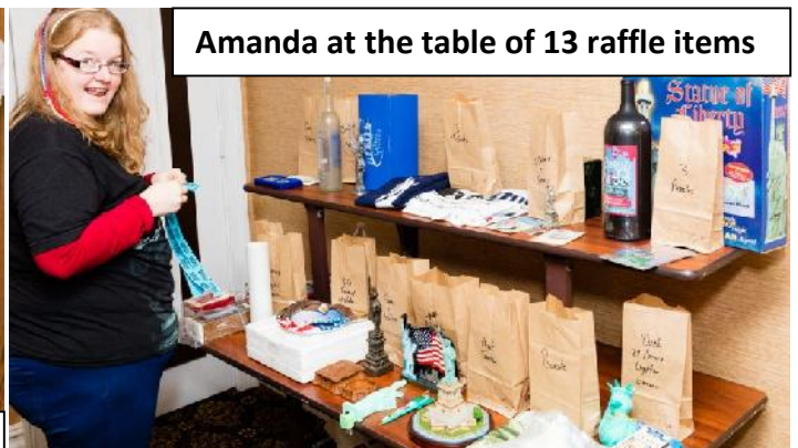
Amanda at the table of 13 raffle items