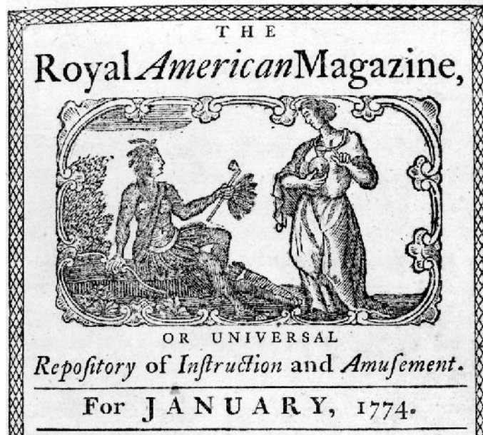
Masthead design by Paul Revere for the Royal American Magazine in 1774 features the Indian Princess symbolizing "America" offering the peace pipe to the Genius of Knowledge.

Once the Enlightenment ideas did spark, they disseminated around the world, but nowhere else did they take root into real radical social change except among the English colonists living in the northeastern part of the North American continent -- in the land of the Iroquois.