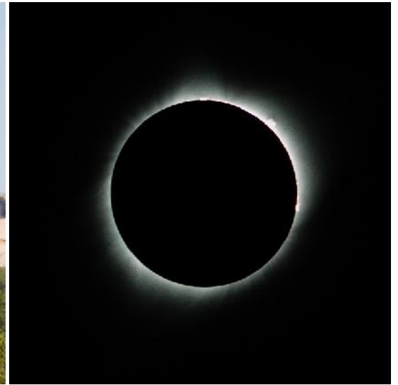
Laurent's pictures of the Crazy Horse Memorial, model in the foreground with actual progress in the background, and the solar eclipse totality.