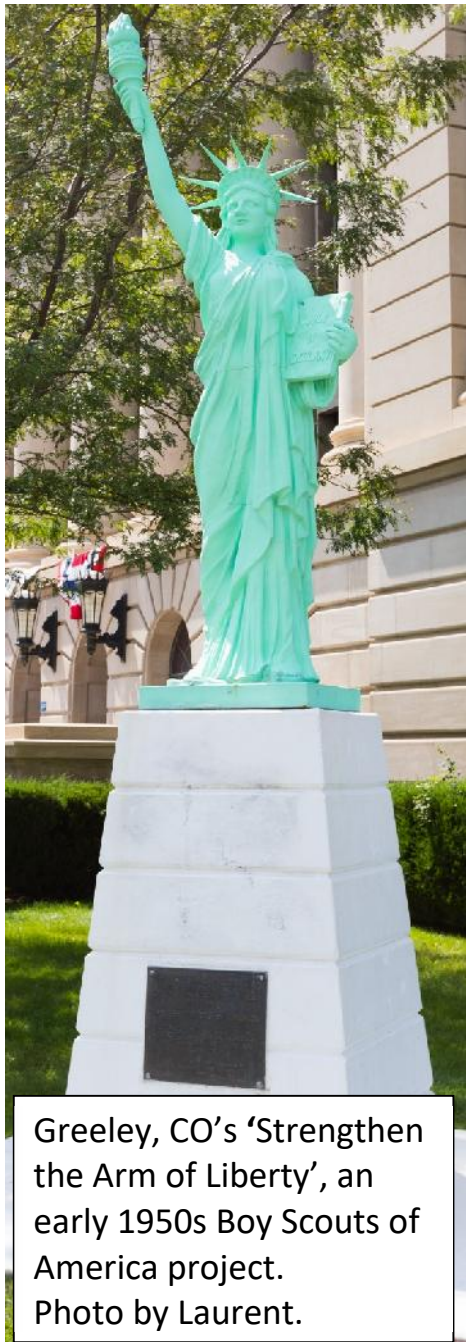
Greeley, CO’s ‘Strengthen the Arm of Liberty’, an early 1950s Boy Scouts of America project.

I completely agree with Laurent’s description, my 101 seconds [1 min. 41 seconds] were magic.)