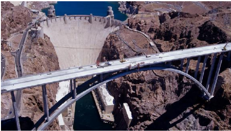
Photo and description Courtesy of Federal Highway Administration from www.npr.org

Saturday, October 28, was the 131 st Anniversary of the 1886 dedication of The Statue of Liberty Enlightening the World , in New York Harbor. Club members assembled at the New York-New York Hotel and Casino to participate in a scheduled series of personal interviews for a documentary about The Statue of Liberty.