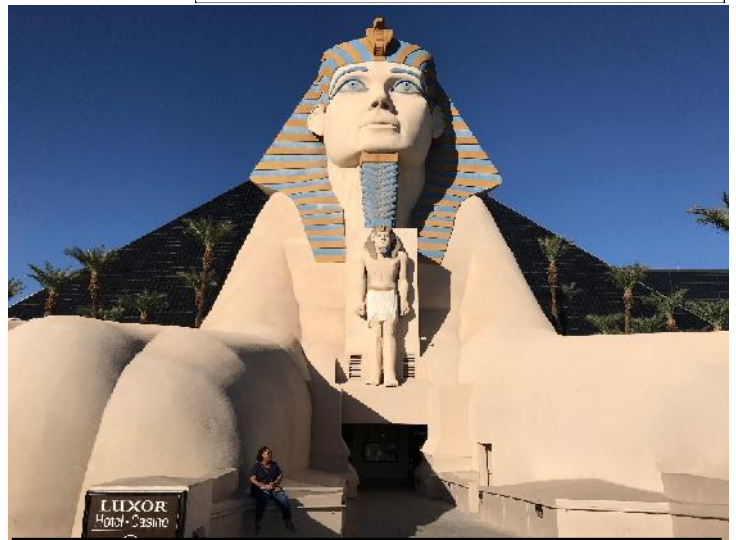
The Sphinx, part of Luxor Hotel & Casino, is reportedly larger than the real thing in Egypt...larger is a Vegas thing. This structure serves as the main entrance for the hotel & casino, car/taxi drop-off & pick-up area and commuter tram station between Mandalay Bay, Luxor and Excalibur properties.