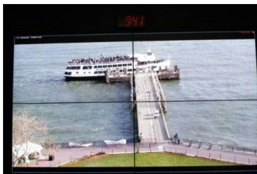
Monitoring of boat dock

Air Fare Example : Round trip New York JFK to Paris CDG on Sept 12-21 is priced at $753 today, March 10, 2014.