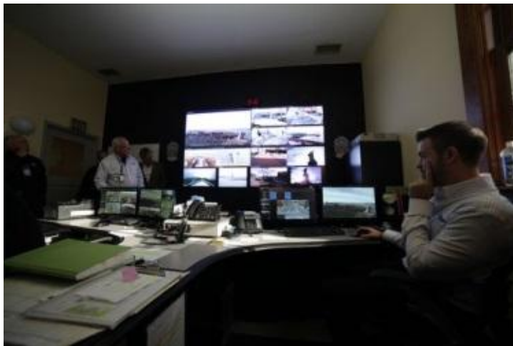
Liberty Island Control Center