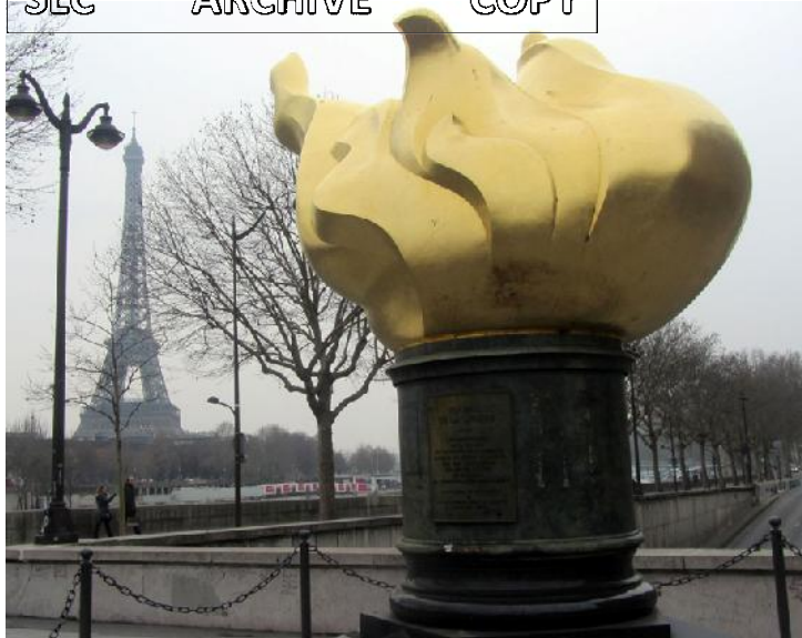
Flame of Liberty with Eiffel Tower in background