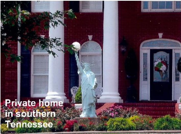
Private home in southern Tennessee