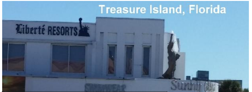
Treasure Island, Florida