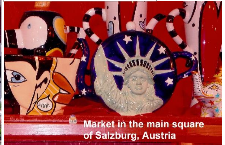
Market in the main square of Salzburg, Austria