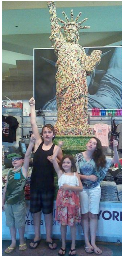
Lebo Newman submitted this picture of a statue in Las Vegas made out of ... Jelly Beans!