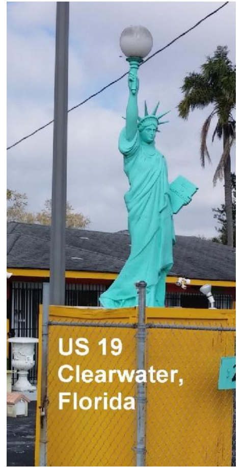
US 19 Clearwater, Florida