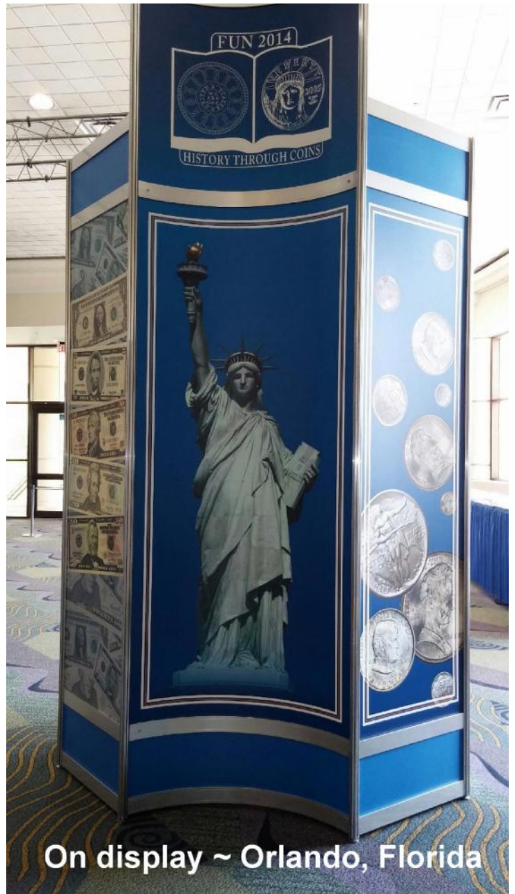
On display ~ Orlando, Florida

Fast forward those 6-months, and I was now living in Woodstock, GA – about 12 hours closer to Orlando but still an 8 hour drive; I also had a newer car and its back seat folds down completely so I have open access from the trunk to the front seats. SO, on Friday July 11, 2014, I drove the 480 miles to Orlando. After checking into my hotel, I visited