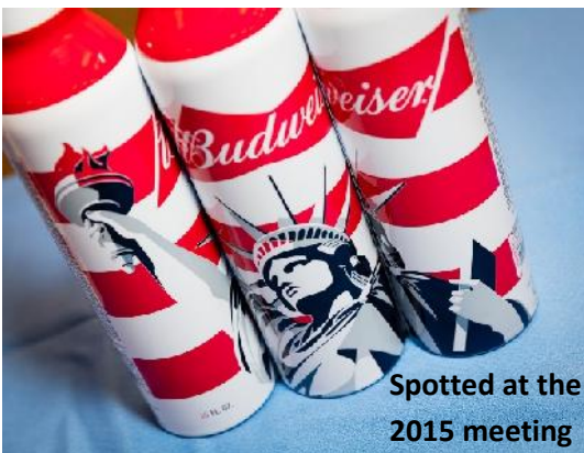
Spotted at the 2015 meeting

Google celebrates the 130 th anniversary of the French delivering Liberty to New York