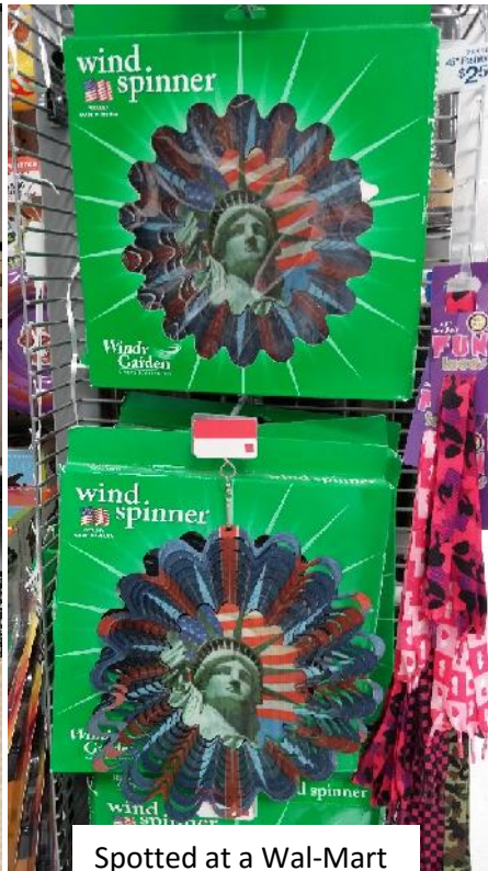
Spotted at a Wal-Mart