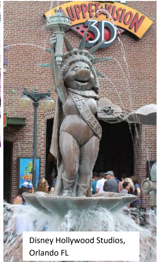
Disney Hollywood Studios, Orlando FL