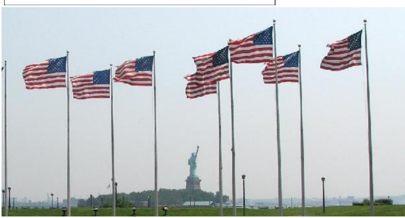
Liberty from 'Black Tom Island' in Jersey City, New Jersey, site of a July 1916 explosion that damaged Liberty's right arm; an act of sabotage by German agents to destroy American-made munitions that were to be supplied to the Allies in World War I