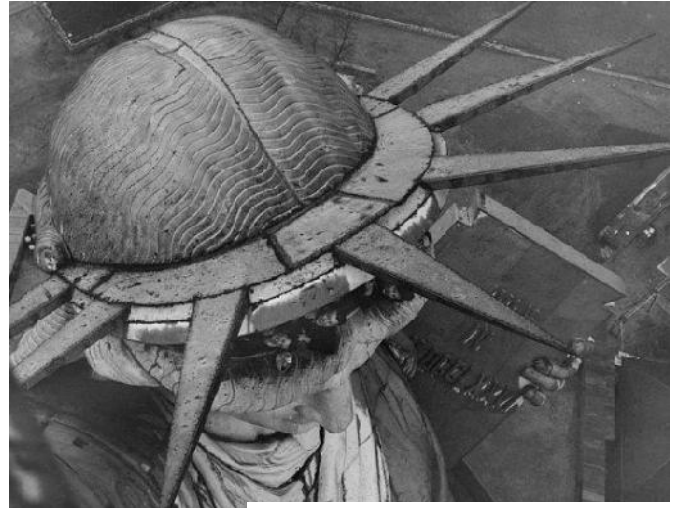
circa 1930 view from the Torch; note visitors in the crown