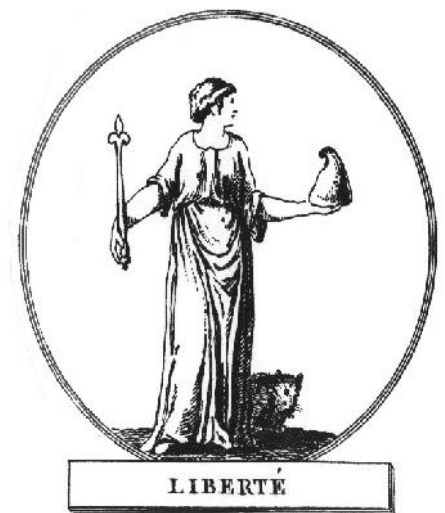
"Liberte" (the ancient Roman Goddess "Libertas") is from: J.B. Huet, "Le tresor des artistes", Paris, France, 1810

Freed slaves were especially devoted to her. A famous votive offering to Libertas was a painting depicting a First Punic War battle in which slaves are shown securing their manumission; it was placed in a temple (aedes), built for her in 238 B.C. In the following