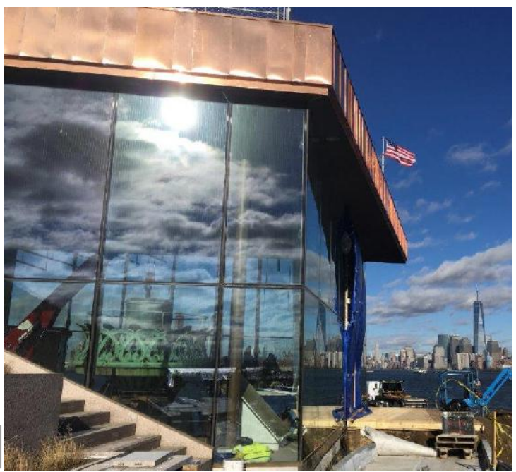
ED: Part 2 of Lebo's article with more pictures will appear in our Summer 2019 newsletter.