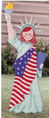
mileskimball.com Planter insert Item # 355176 $19.99 One is in a planter at Iris' home.