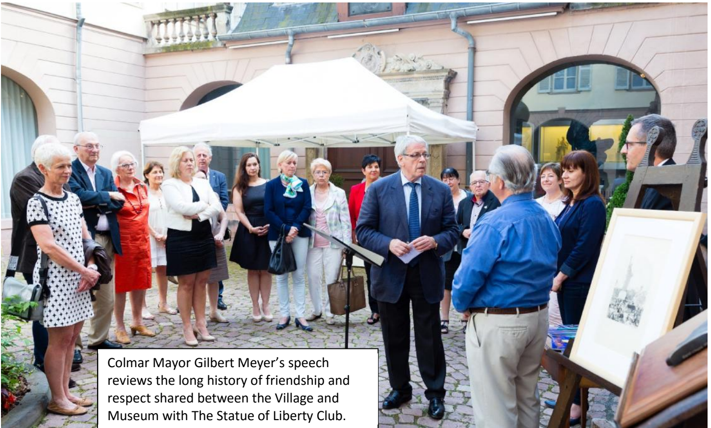
Colmar Mayor Gilbert Meyer's speech reviews the long history of friendship and respect shared between the Village and Museum with The Statue of Liberty Club.