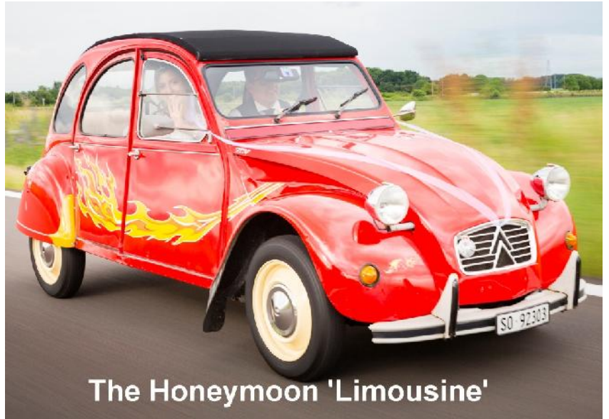
The Honeymoon 'Limousine'

The Name-Place box contained the 5-course meal menu, including wines, printed around the other 3 sides. Inside the box were Ricola lozenges – Ricola is Christian’s employer. The wedding details were ... detailed!