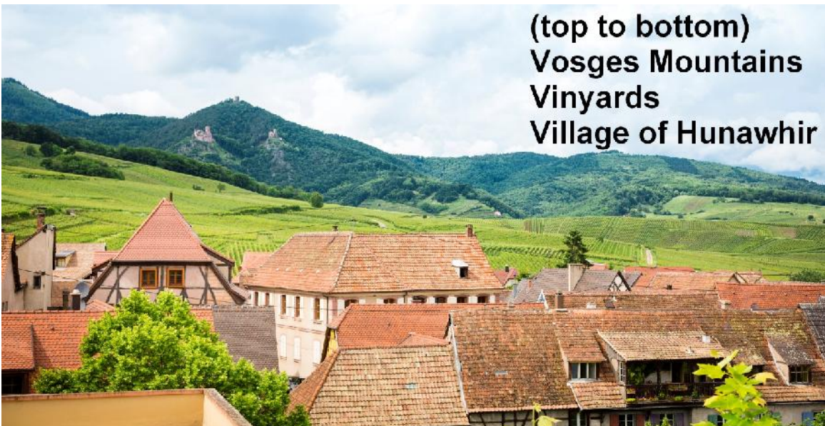
(top to bottom) Vosges Mountains Vinyards Village of Hunawirh