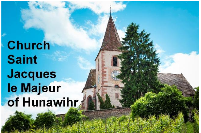
Church Saint Jacques le Majeur of Hunawirh