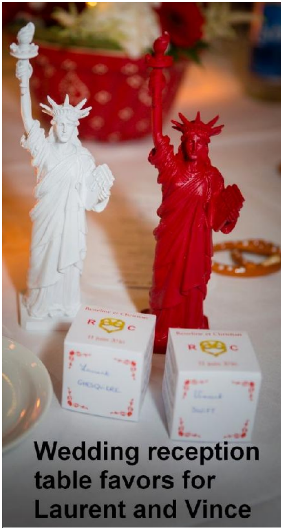
Wedding reception table favors for Laurent and Vince

The Name-Place box contained the 5-course meal menu, including wines, printed around the other 3 sides. Inside the box were Ricola lozenges – Ricola is Christian’s employer. The wedding details were ... detailed!