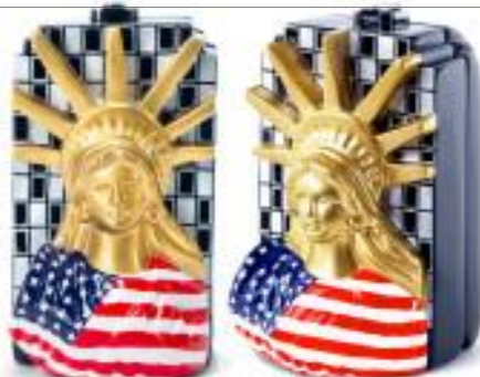
Timmy Woods $500 handbag; On stuccu.com search Lady Liberty Handbags