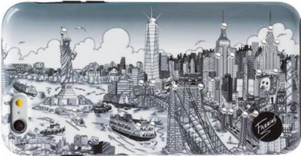
New York City iPhone 6 cover embellished with genuine Swarovski Crystals