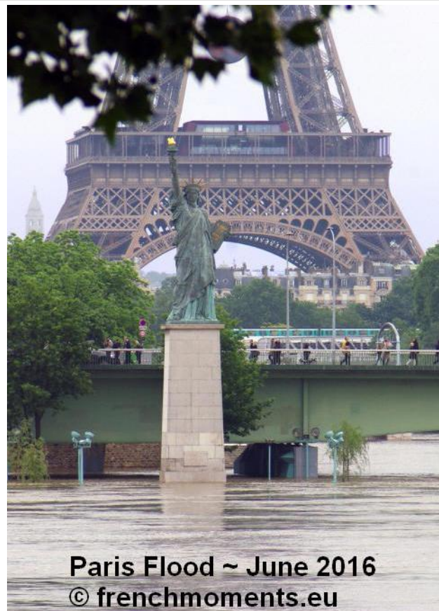
Paris Flood ~ June 2016

Seine River flooding in early June covered the island where the 1/4 size Statue of Liberty is located. The floodwaters rose above the level of the young girl in the picture on the left.