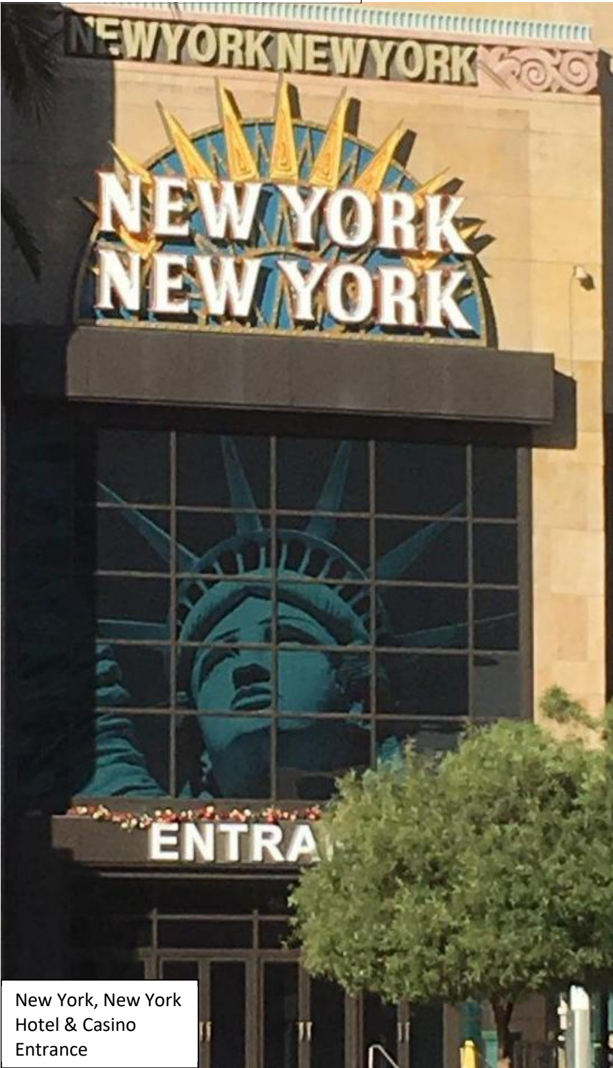
New York, New York Hotel & Casino Entrance