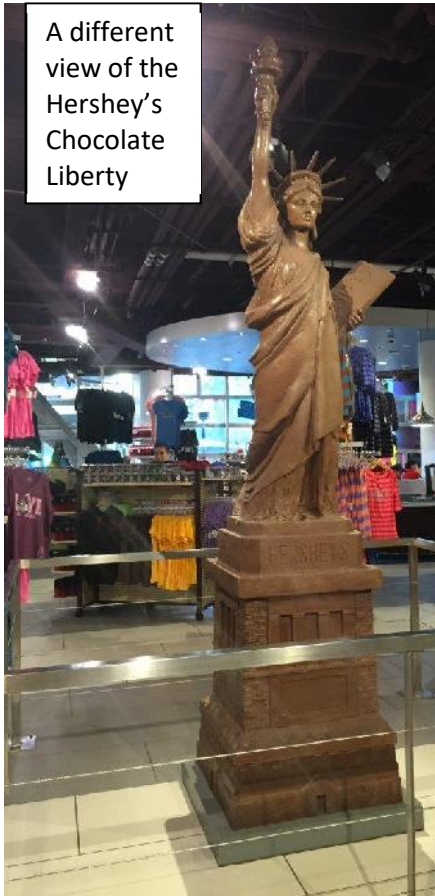
A different view of the Hershey's Chocolate Liberty