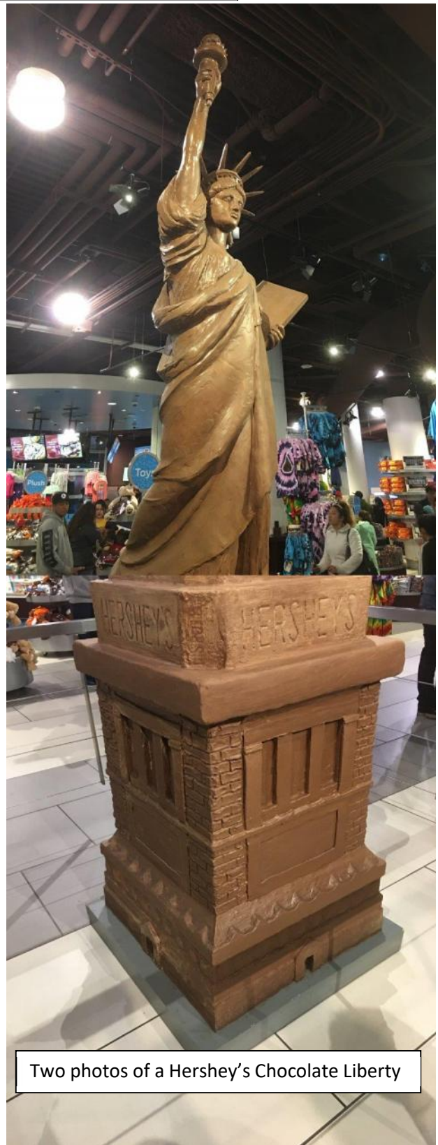
Two photos of a Hershey's Chocolate Liberty