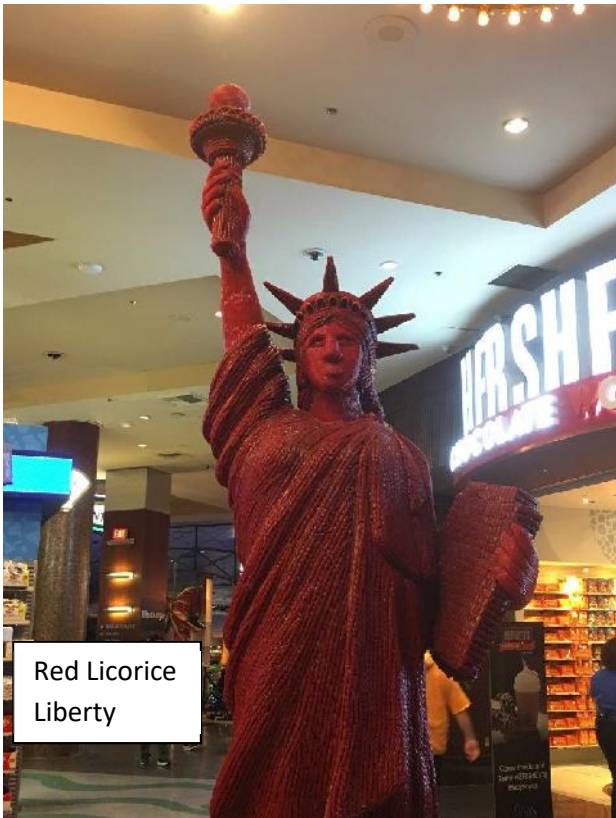
Red Licorice Liberty