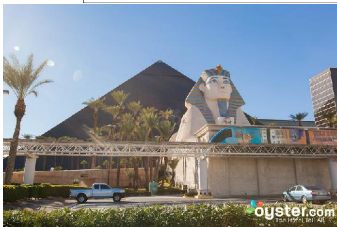
[ED: Luxor exterior]