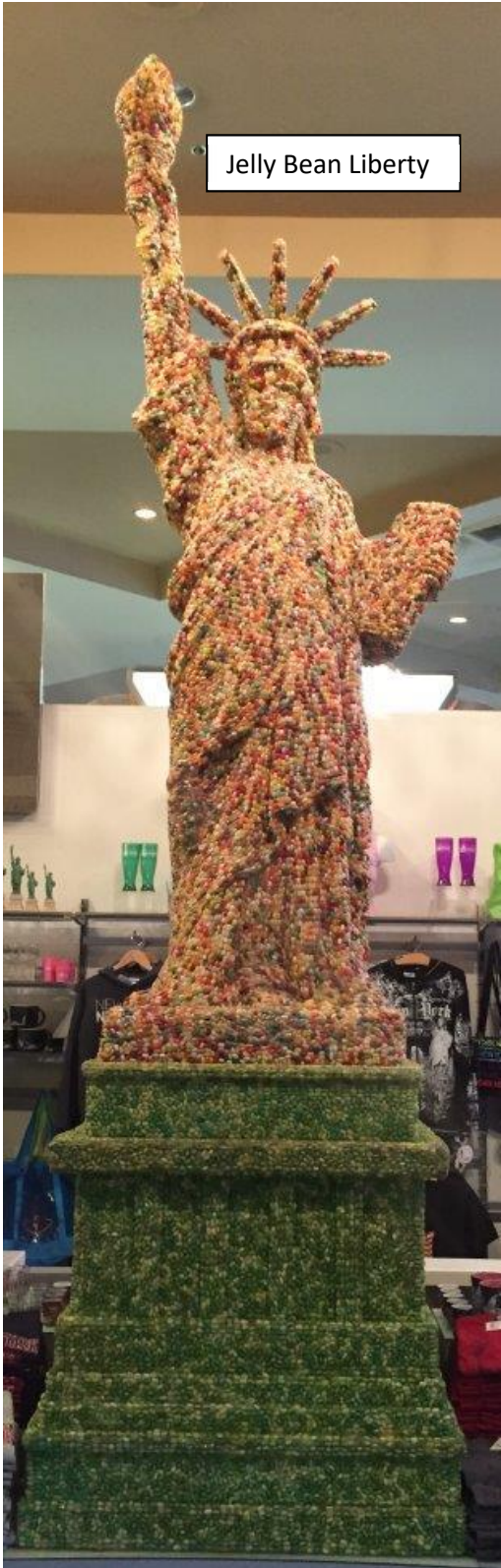
Jelly Bean Liberty